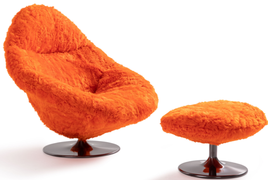
010 001 — Swivel armchair

The sheepskin cover is available in: Yellow FENDI, Caribe, Orange, Nude, Sale and Mist. Base — Turned sheet metal support, with self-lubricating swivel mechanism, locked into the footrest. Circular satin finish and scratch-resistant Gunmetal finish.